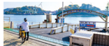
Hop on a ferry to Mukaishima Island!

Fare Payment: Use the ticket machine in the waiting area (available at some terminals) or pay a staff member on board.