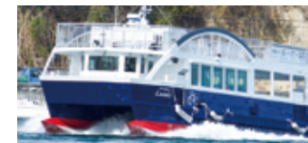
The "Cycleship Lazuli," featuring bike stands and maintenance tools, operates irregularly on the Onomichi–Innoshima Island – Ikuchijima Island (Setoda) route.