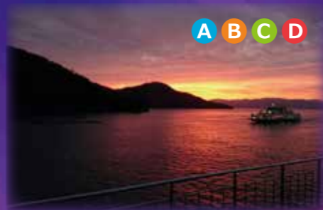
Evening view of the Seto Inland Sea