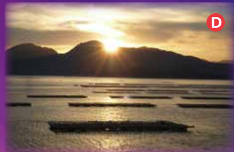
Off the coast of Mitaka Port