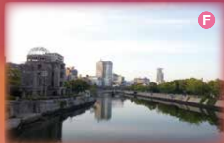
Atomic Bomb Dome viewed from the boat