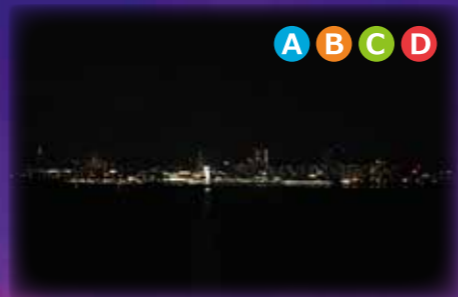
Night view of the Seto Inland Sea